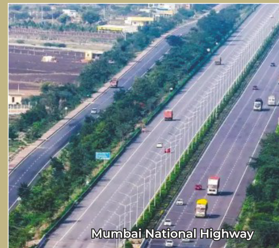
Mumbai National Highway