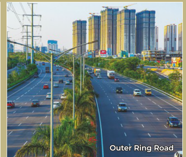
Outer Ring Road